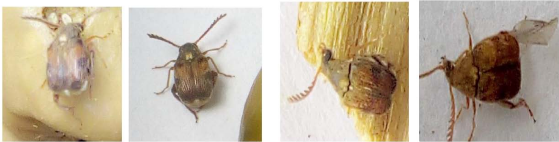
Callosobruchus chinensis C. chinensis C. chinensis C. chinensis

(Females, the former two; left and males with distinctive antennae, the latter two; right)