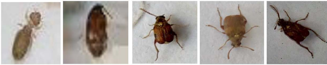
Liposcelis sp. C. dimidatus Callosobruchus sp. Callosobruchus sp. Callosobruchus sp.

Partial views of pictures of insect pests recorded from stored faba bean grains of farmer’s storages of the study area