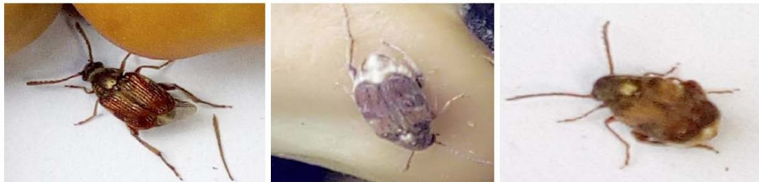
Callosobruchus sp. Zabrotes subfasciatus Z. subfasciatus

(Females, the former two; left and males with distinctive antennae, the latter two; right)