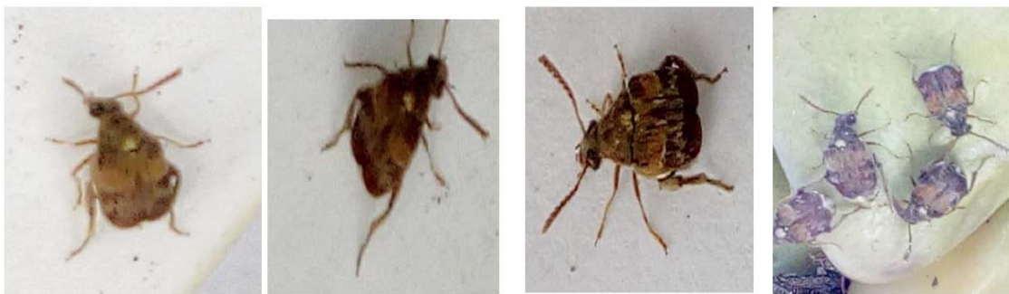
Callosobruchus maculatus C. maculatus C. maculatus C. maculatus

( Z. subfasciatus Adult- globular with long legs and antennae, elytra patterned and do not fully cover abdomen, spines at tip of tibia on hind leg)